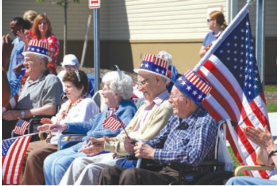
Residents of the Wegman Family Cottages and patients of the McCormick Transitional Care Center celebrated Independence Day with Unity staff.

Submit your photos for Unity Connection in print and online! Email them to unitynews@unityhealth.org